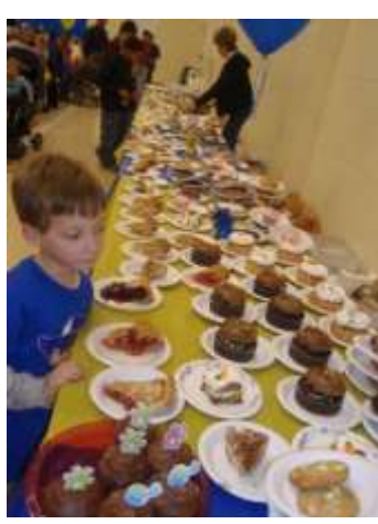
WHICH ONE DO I CHOOSE?