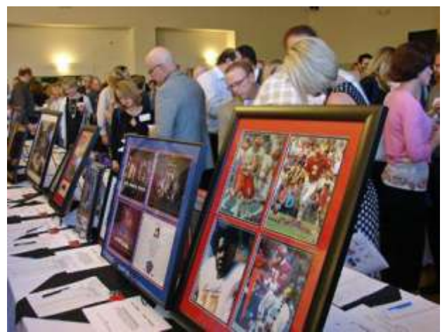
Guests viewing some of the silent auction items.